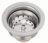
Sink Strainer Optional