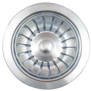
Sink Strainer Optional