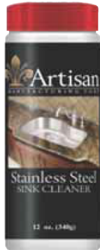
Stainless Steel Sink Cleaner Optional